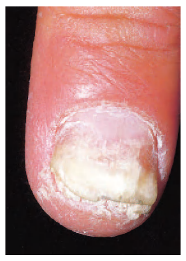
Plate 8 Tinea of a fingernail.