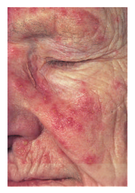
Plate 3 Rosacea.