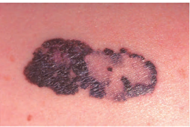
Plate 10 Superficial spreading melanoma.