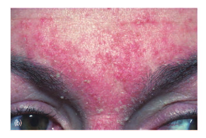
Plate 11 Seborrhoeic dermatitis.