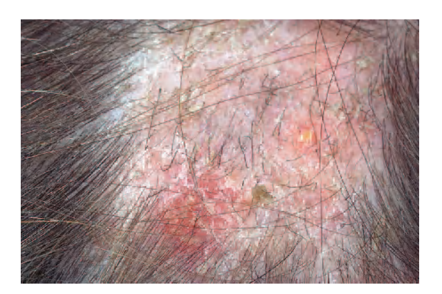
Plate 6 Tinea capitis.