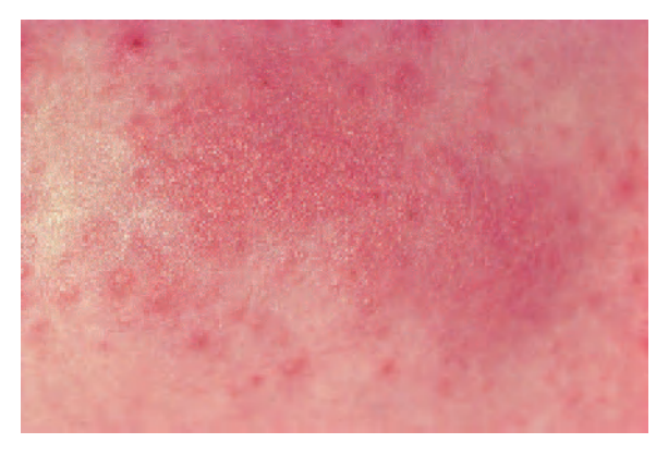
Plate 1 Typical eczema dermatitis rash.