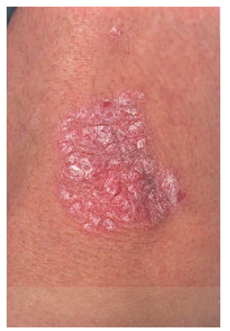
Plate 12 Psoriasis vulgaris.