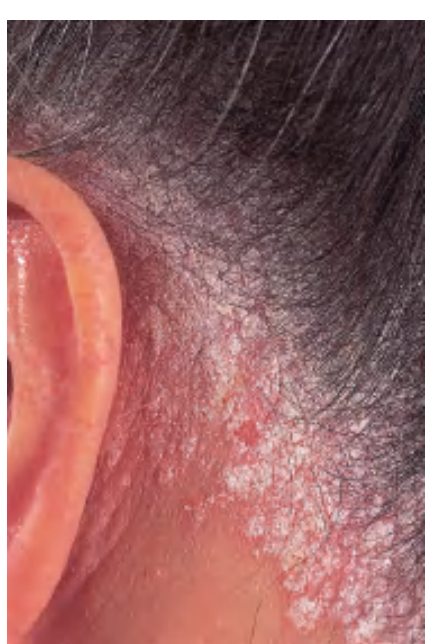
Plate 13 Scalp psoriasis.