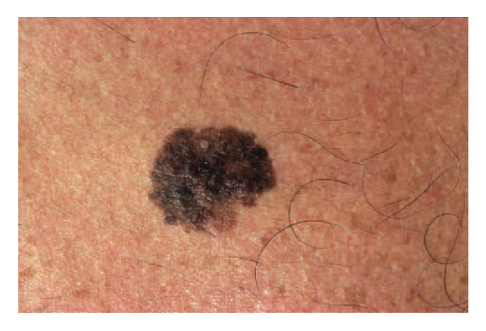
Plate 9 Malignant melanoma.